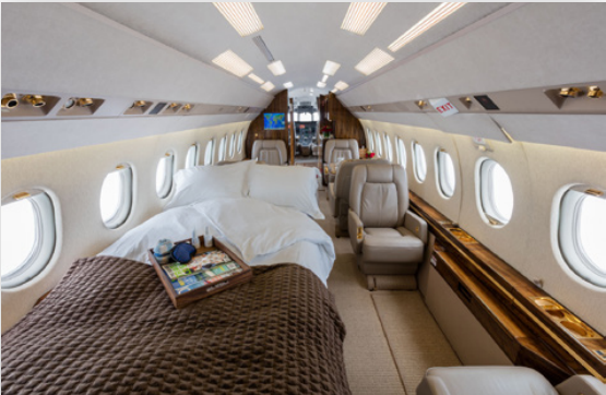
Cabin Seating For Up to 10