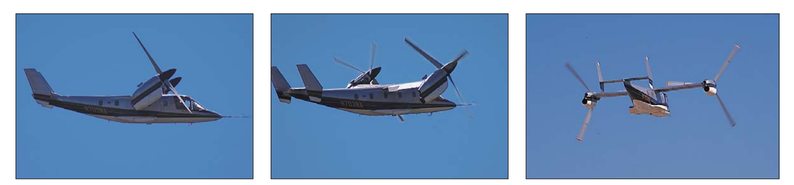
less than one min. Engine tilt control is managed with an easy-to-use "coolie hat" toggle switch on the collective. In "full forward," the XV-15 feels just like an airplane.

In airplane mode, the XV-15 flew just like an airplane with the only real difference being that to add power, you pull up on the collective instead of pushing throttles forward. Hopkins did a couple of conversions and then had me do an aerodynamic stall, which occurred at 110 kts clean.