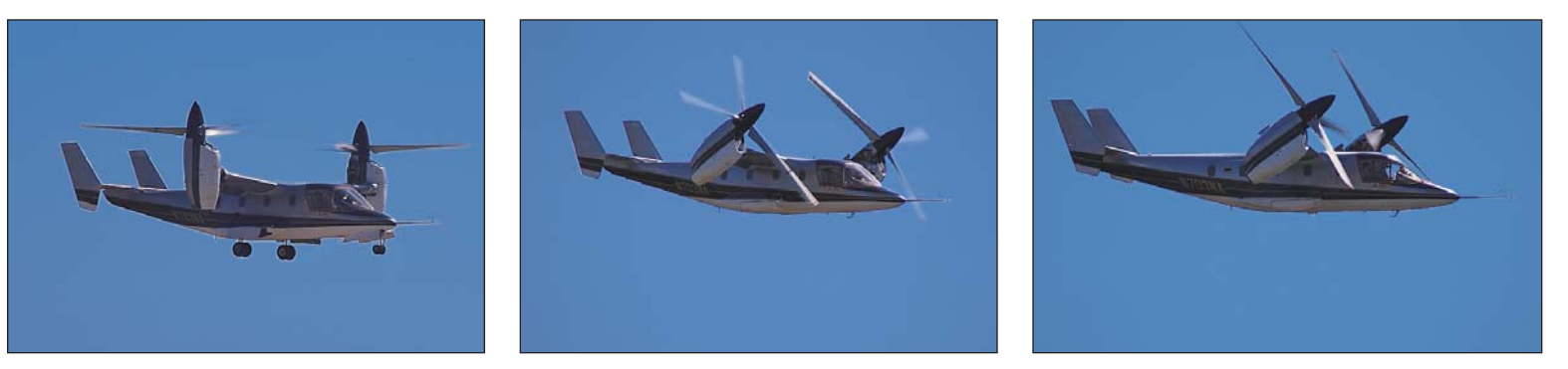
The conversion from a vertical nacelle angle to full-forward airplane mode can be accomplished in as little as 12-sec with a zero to 200-kt acceleration in

Although the XV-15 is strictly a proof-of-concept aircraft, it operates the same way and does the same things that the 609 will. I was particularly impressed with