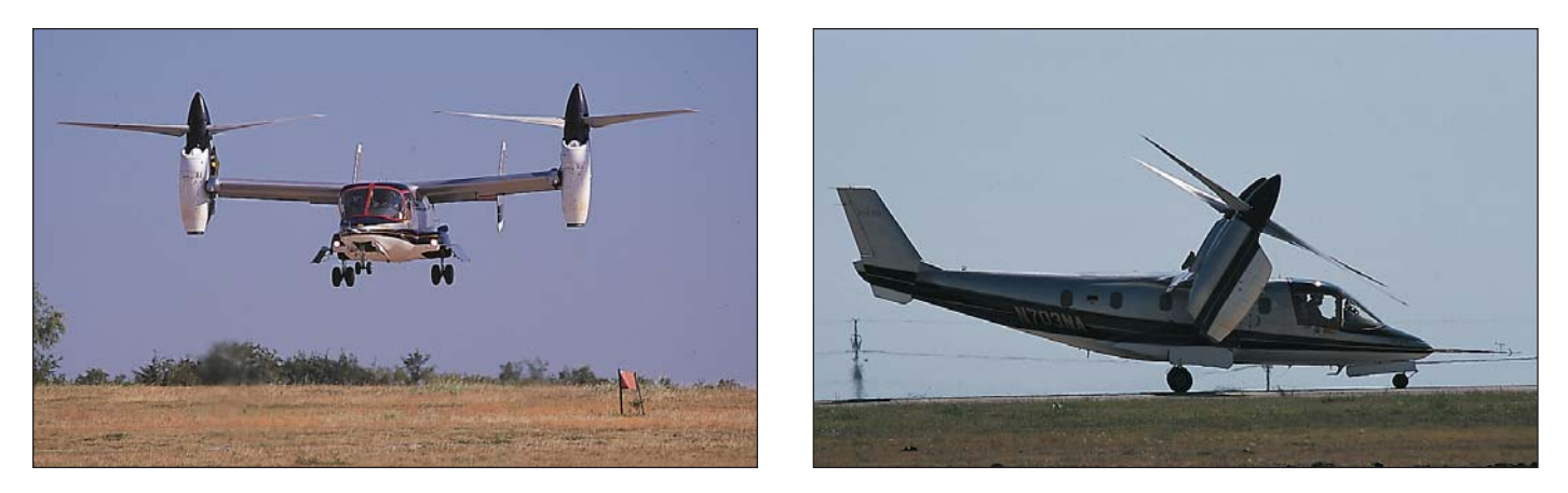
Lacy maneuvers the XV-15 side-to-side using blade tilt (above L). After executing a rolling 20-kt touch-and-go approach to landing (above R), Lacy perfromed a running takeoff with a 60-degree nacelle angle (top photos on opposite page).

Stall characteristics were excellent with full-aft stick—you just start to feel the stall buffet and then come down with no wing or nose drop. Flying out of the stall is just a matter of pulling up on the collective to add power.