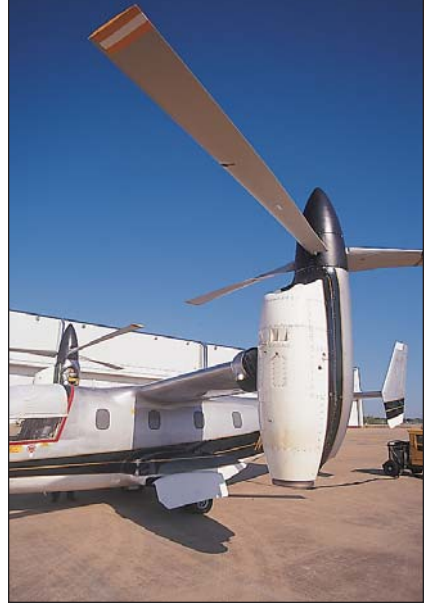
(Clockwise from top): The panel of the XV-15 proof-of-concept test platform features an EFIS display on the left for evaluation of differential-GPS steep approaches. The 609 will feature P&W PT6C-67A turboshaft engines, as opposed to the XV-15's Lycoming powerplants. Double-tire main gear will ensure smooth ground ops. The 609 will feature a T-tail, rather than the XV-15s lower horizontal tail surface, to eliminate aerodynamic buffet during transition.

components as possible available on condition.