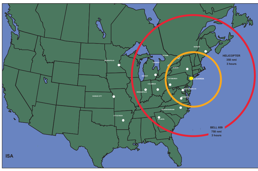
An artist conception depicts Bell's 609 civil tiltrotor flying in downtown New York (top). The Bell 609 pushes the practical frontiers of VTOL operation from 350 nm out to 750 nm.